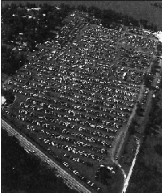
AERIAL VIEW OF AUTORAMA